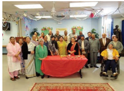
Diwali Celebration at Indo-American Center

In October 2008, the Indo-American Center celebrated Diwali. Over 50 community members came to enjoy the festivities put on by the Center.