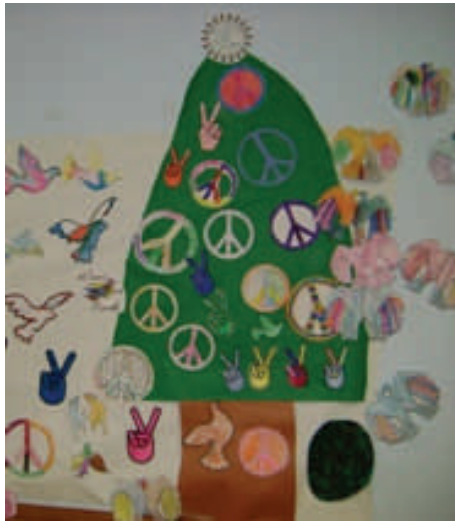
Artwork of Peace displayed at Holiday Party

“Peace in the East, peace in the West, peace for you, peace for me” - IAC Youth Program Participant.