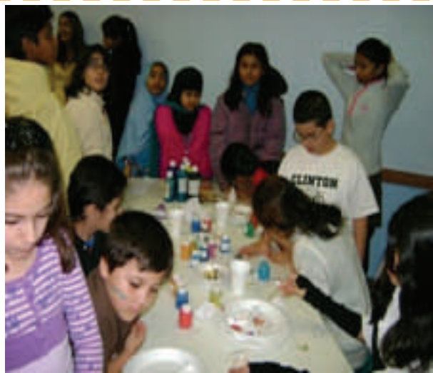
Youth face Painting at Holiday Party