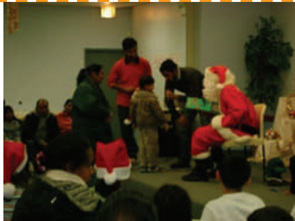
Opening Presents from Santa